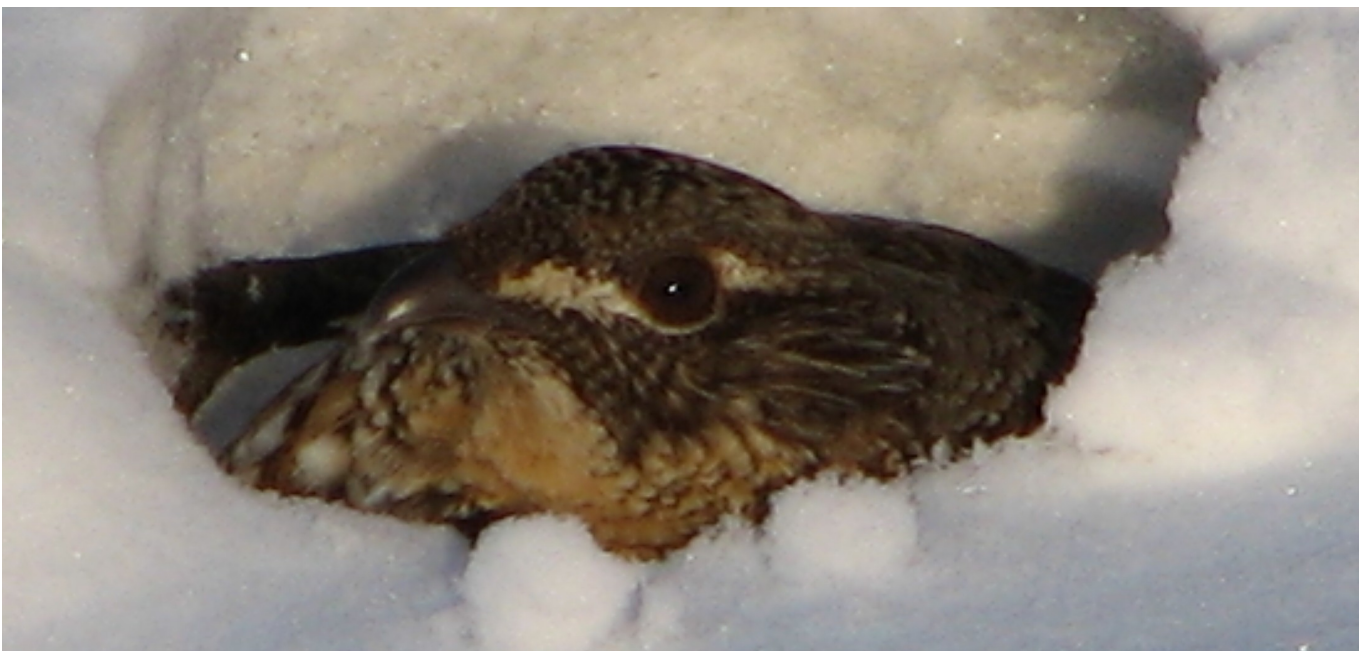
Ruffed Grouse - Hiding away from the cold in its "snow-roost."

When the jello has dissolved, fill one container halfway for each pair of students. This container is a "pretend" animal that the students must find a shelter outdoors to keep it warm enough and alive over winter - in this case, keep from